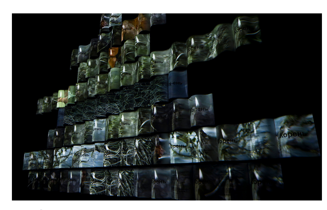
Souche 2.0 , Anne-Sophie Emard, Theater workshop, Pskov (Russia) | © photo : Anne-Sophie Emard | VIDEO FORMES

Artist's network: https://www.instagram.com/annesophie.emard/