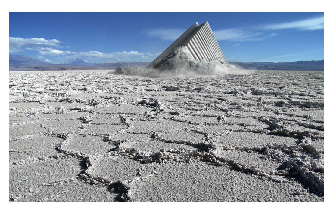
Under the centipede sun, Mihai Grecu

Artist's website: <a href="https://mihaigrecu.net/">https://mihaigrecu.net/</a>