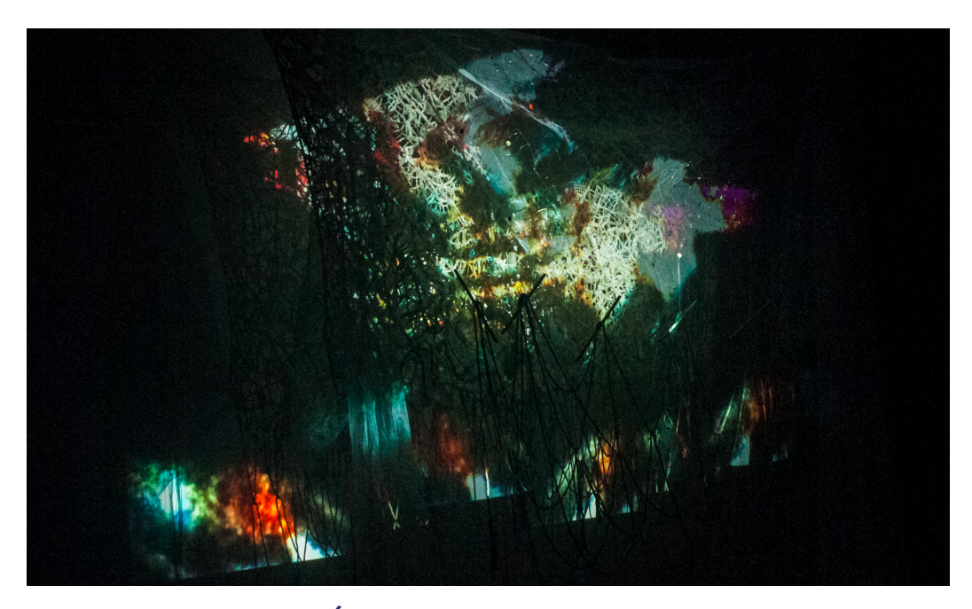
Tejer un cuerpo, Úrsula San Cristóbal | Salle Gilbert-Gaillard, Clermont-Ferrand | © photo : Úrsula San Cristóbal | VIDEOFORMES 2023 Festival