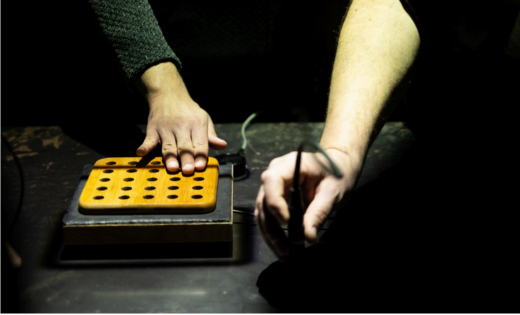
Materia , Alain Wergifosse | Chapelle de Beaurepaire, Clermont-Ferrand | © photo : Kamil Touil VIDEOFORMES 2024 Festival