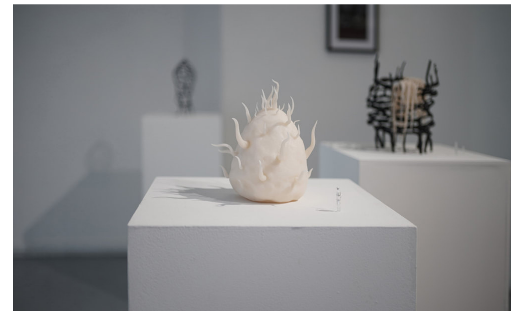
Morphogenetic Tensions, Golnaz Behrouznia |