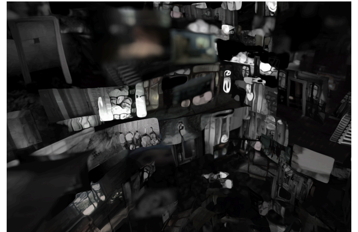
Monades et machines de mémoires

La DIODE, 190-194 boulevard Gustave Flaubert 63000 Clermont-Ferrand, FR