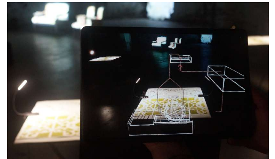
Blaise Pascal et les jardins , Annie Bascoul | Chapelle de l'Oratoire Clermont-Ferrand | VIDEOFORMES 2023