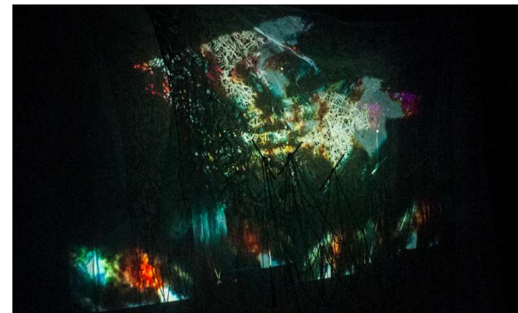
Tejer un cuerpo , Úrsula San Cristóbal | Salle Gilbert-Gaillard, Clermont-Ferrand | © photo : Úrsula San Cristóbal | VIDEOFORMES 2023 Festival